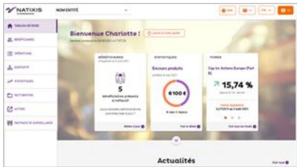
Source: Natixis Interépargne October 2024. For illustration purposes only

Watch the demonstration video of your future company portal 1